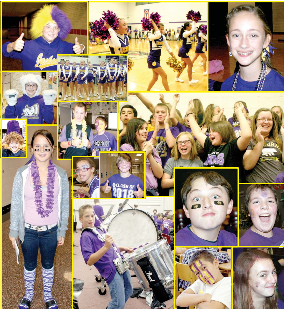
MORE PICTURES AT www.facebook.com/jacksonschools