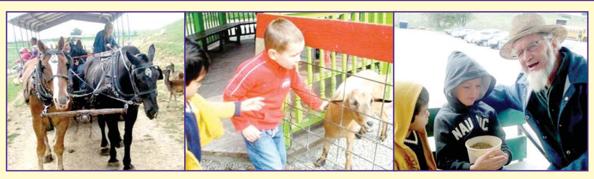
Amherst Kindergartners visit Rolling Ridge Ranch